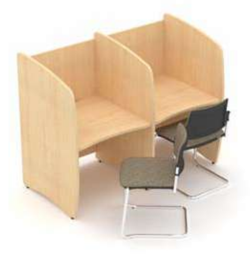
Set of 2 StudyHubs in maple shown with Brandon chairs page 152.

Please add the wood suffix to your code when ordering eg: SHSB80BE