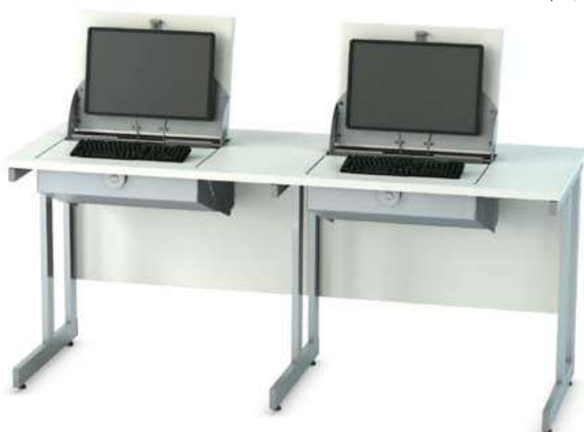
SmartTop Double (Left and right hand options)