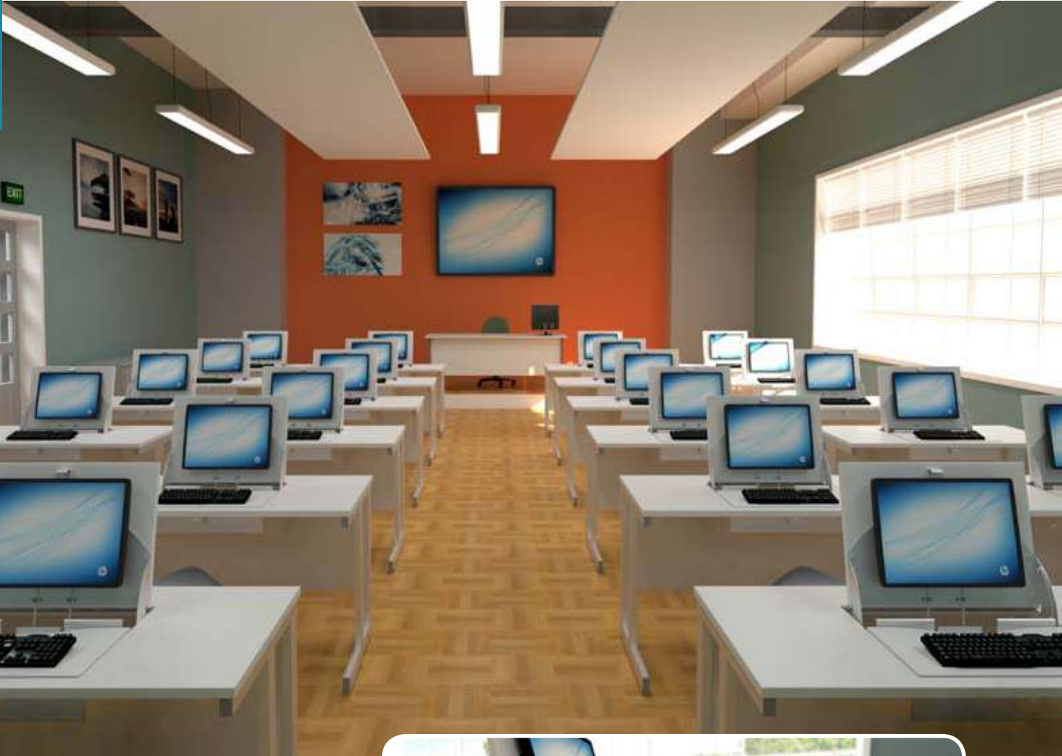
Above: Single SmartTops centered in white with silver frames.

The SmartTop desk mechanism quickly folds a monitor, keyboard and mouse into a secure compartment beneath the desk surface. Perfect for classrooms and training suites, the SmartTop desk delivers flexible facilities and secure storage in one innovative solution.