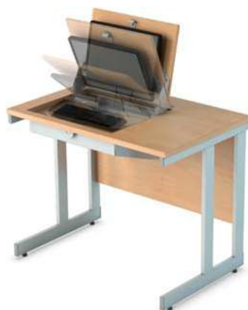
SmartTop single (Left, right and central hand options)