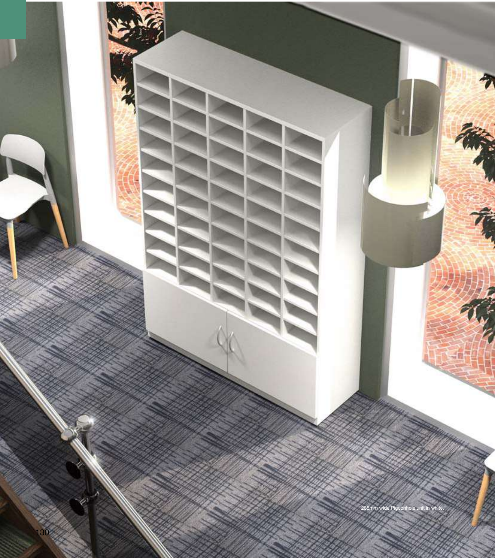
1285mm wide Pigeonhole unit in white.

Pigeonhole units are still a very popular solution for storing and organising documents. We have selected a few options. Other configurations are available.