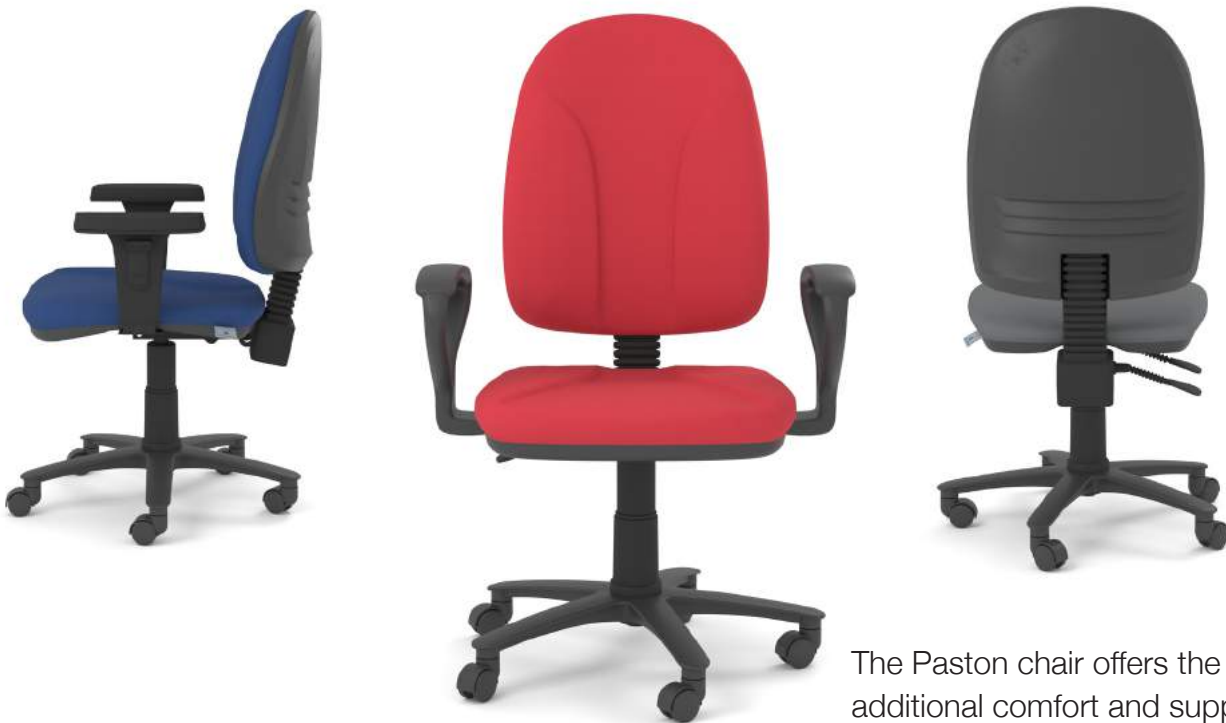
The Paston chair offers the additional comfort and support of a contoured seat and back pad.

Good quality task seating will contribute to general employee well-being, which in turn will reduce absence and increase productivity. Both ranges carry a 5 year quality guarantee.