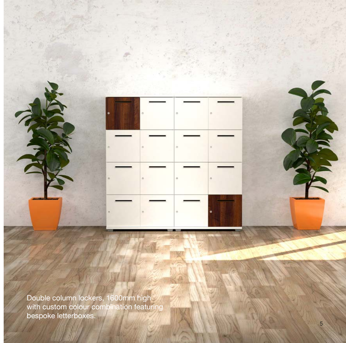
Double column lockers, 1600mm high with custom colour combination featuring bespoke letterboxes.