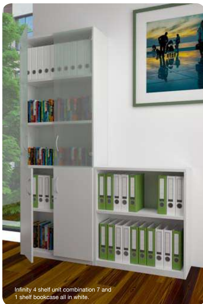
Infinity 4 shelf unit combination 7 and 1 shelf bookcase all in white.

Wood finishes are heat, stain and scratch resistant when used for their intended purposes.