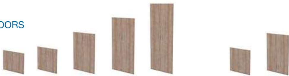
Lower Doors – Desk High, 1, 2, 3 and 4 Shelves