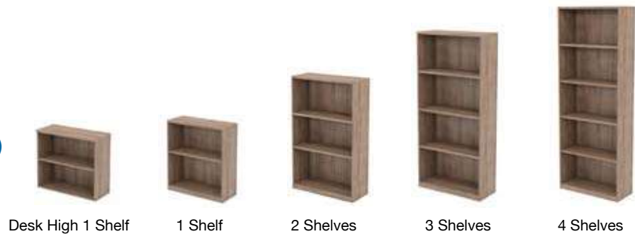
Desk High 1 Shelf