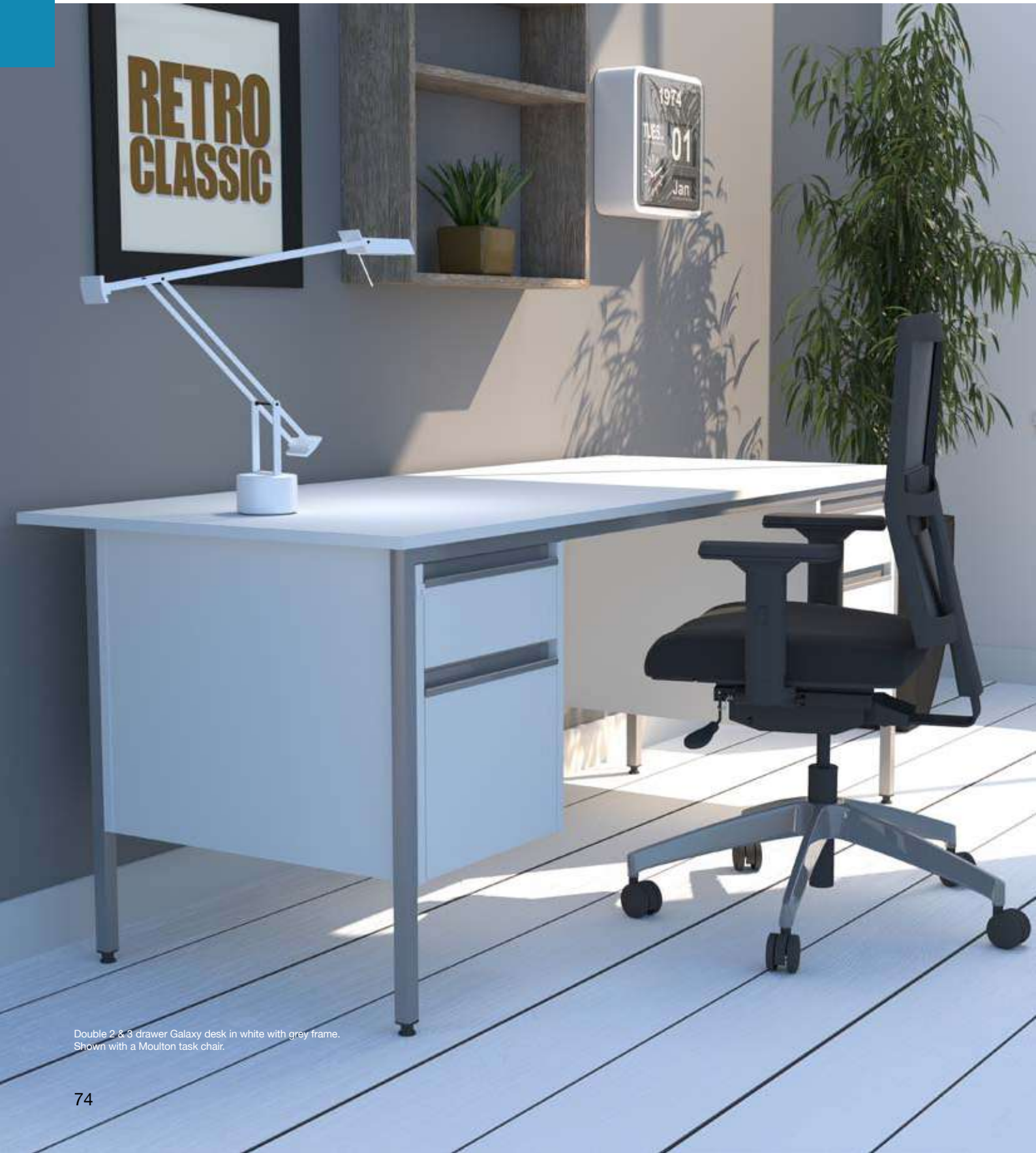
Double 2 & 3 drawer Galaxy desk in white with grey frame. Shown with a Moulton task chair.

The Galaxy desk is an enduring favourite. Available in beech, light oak or white, with a grey or brown frame colour option, the Galaxy desk is practical, robust and here to stay.