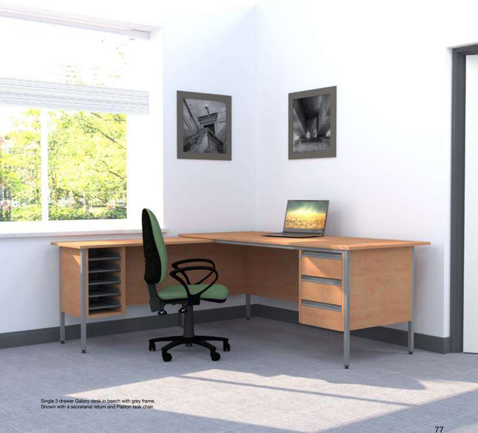
Single 3 drawer Galaxy desk in beech with grey frame. Shown with a secretarial return and Paston task chair.

Only suitable for fixing to the 1500mm and 1800mm single pedestal desk. White finish not available on secretarial return.