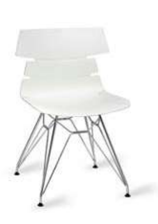
ASHBY CHAIR, LEG STYLE N