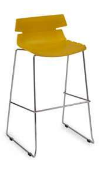
ASHBY, HIGH STOOL