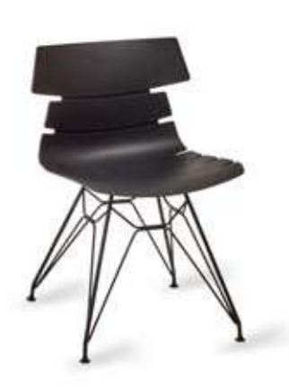
ASHBY CHAIR, LEG STYLE M