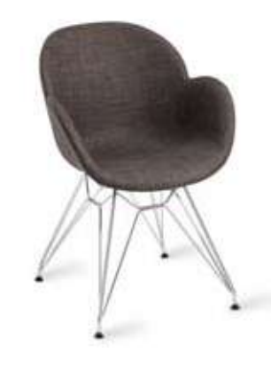
WROXHAM CHAIR, LEG STYLE N